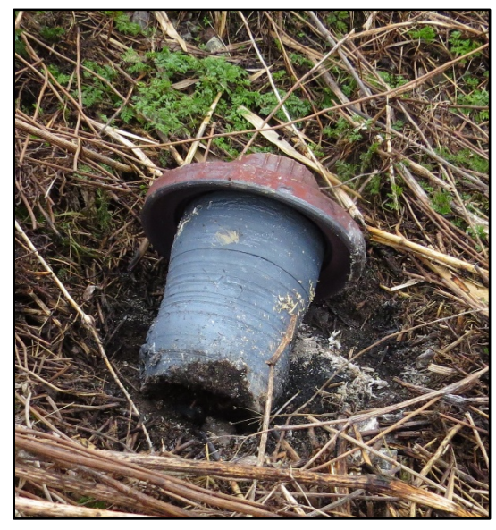
Figure 3. Overheated burnt-off axle journal stub

Rail fastening elements and ties on the east side of the track showed fresh abrasion marks starting at Mile 116.89. About 150 feet away, a deep groove was visible in the ballast and on the ties between the 2 rails. The wooden planks of a private crossing and the frog of turnout U226, located at Mile 117.24, showed signs of damage. These marks show that after the axle journal broke and the wheelset derailed, the truck was dragged about 2700 feet to the site of the main pileup of derailed cars. From this point, about 400 feet of main track was destroyed.