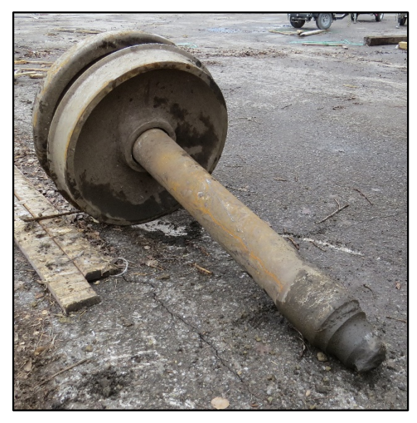
Figure 4. Melted wheelset and wheels of car TR 405202

The underside of the car body showed a deep cut and rub marks, beneath the body bolster of the Bend truck, as well as heat- and smoke-related discolouration across from the R1 wheel position.