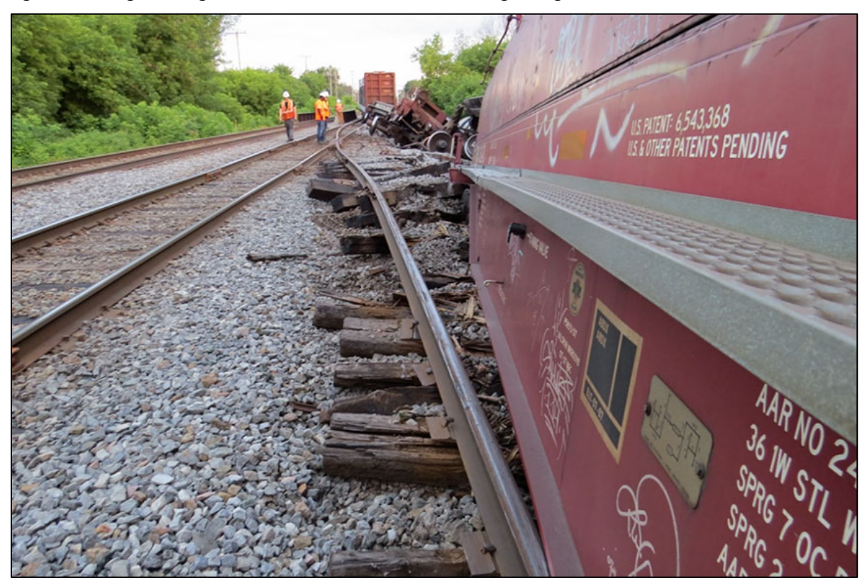
Figure 4. Damage looking north, at the north end of the CC Long Siding track

The east rail of the CC Long Siding track had shifted outwards, and several spikes were lifted on the inside of the rail. Numerous marks were present along the rail base. The CC Long Siding track infrastructure showed no wheel marks to the south of the derailed cars. The ties in the curve at the north end of the CC Long Siding track leading to the main track were destroyed. Several of the ties were shattered, with the wood fibres on the top surface shredded by the wheels. Deep grooves were visible on other parts of the ties, and the wood was deteriorated on many of the ties.