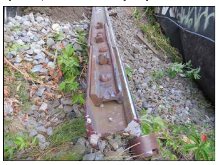
Figure 3. Ruptured rail on the CC Long Siding track