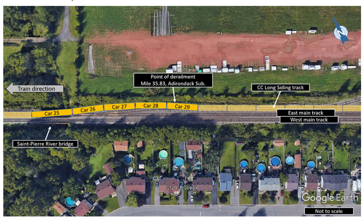
Figure 2. Derailed cars at the north end of the CC Long Siding track at Delson, Quebec

The LE then contacted the rail traffic controller (RTC) to inform him of the derailment and request assistance from emergency services. The conductor was taken to the local hospital for examination and treatment, and was discharged that same day. The consequences of the derailment were minimized by the fact that the conductor was positioned to observe the incoming movement and that he communicated with the LE in a timely manner.