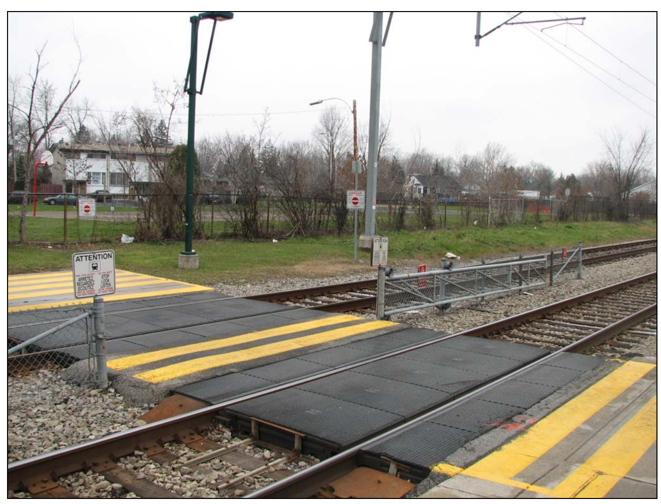
Photo 1. Platform link at the north end of the Roxboro-Pierrefonds Station

There is a platform link at each end of the platforms, allowing commuters to move between the station's east and west platforms. The platform links cross the main track and siding at right angles. They are considered unrestricted access private crossings. They consist of rubber sheeting designed for road crossings (see Photo 1). They measure 22.5 feet long by 15 feet wide. There are no automatic protection devices to warn that a train is coming or to prevent commuters from crossing the tracks when a train is coming. Two signs are posted on the fence between the tracks, warning commuters to use caution when crossing the tracks.