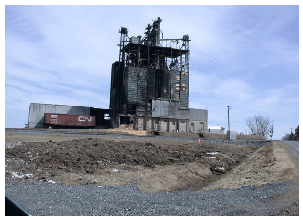
Photo 1. Damaged facade of the mill (photo taken two months after the accident)

Car WC 65061 was followed immediately by three other cars loaded with scrap metal and then by tank cars CGTX 64270 and GATX 9200 carrying propane and by tank car PROX 83006 carrying chlorine. Tank car CGTX 64270 caught fire and exploded, damaging the mill, which was empty at the time of the accident (see Photo 1). Cars GATX 9200 and PROX 83006 were heavily damaged and affected by the fire, but did not lose their content. The other cars carrying dangerous goods (hydrocarbons, UN 1863) were among the last to derail. They were damaged but were not affected by the fire and did not lose their content.