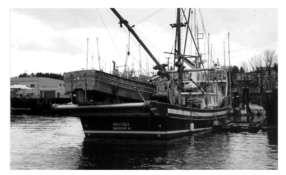
Appendix B - Photographs