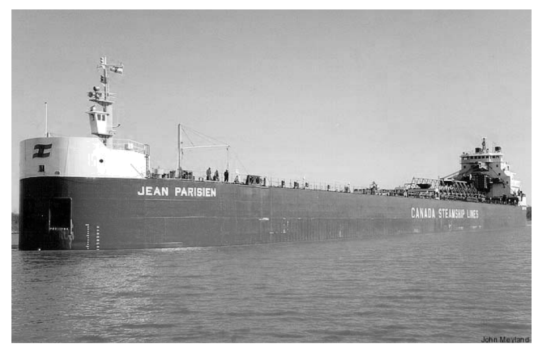
Appendix B – Photographs