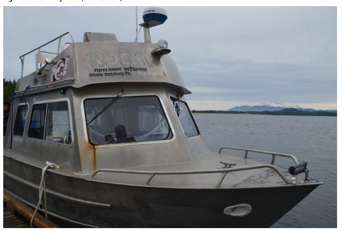
Figure 1. The Rocky Pass