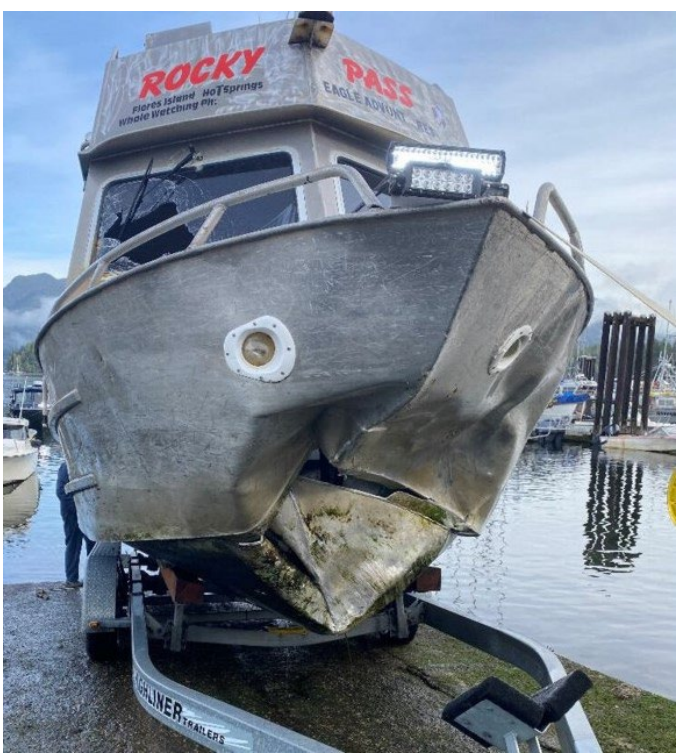
Figure 2. Damage sustained by the Rocky Pass following the occurrence

impact with the rock (Figure 2), was towed to Tofino.