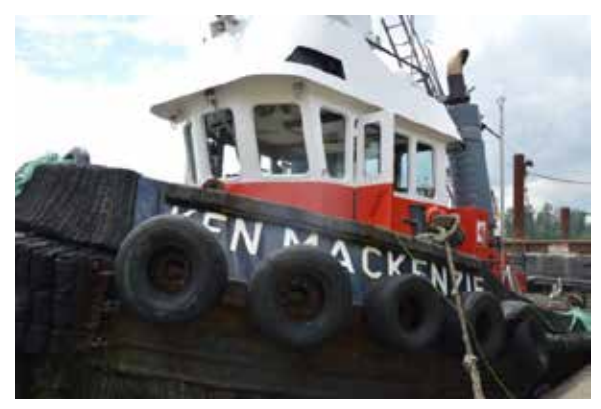
Figure 1. Tug Ken Mackenzie

radiotelephones with digital selective calling, a radar, a magnetic compass, an autopilot, a global positioning system (GPS), an automatic identification system (AIS)<sup>1</sup>, and an echo sounder. A galley containing a compact oven, a fridge, a microwave, and a settee is located aft of the helm station.