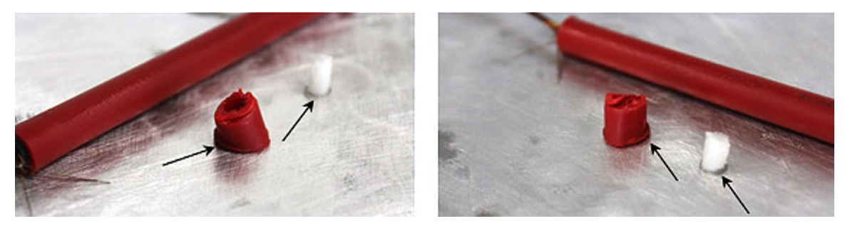
Figure 5. Fragments continuing to melt, and cable jacket starting to melt at 124 °C

Figure 4. Polythene fragments starting to melt at the surface of the plate (indicated by arrows) at 113 °C