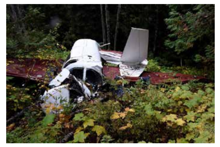
Figure 6. Accident site, view looking downhill

the impact sequence. When initial power was applied to the ELT, it started to transmit a strong signal, which confirmed that the inertia switch was in the activated state. Due to the absence of the antenna, signal detection would have been limited to a few metres. Furthermore, without a battery, the ELT transmission would have ceased immediately.