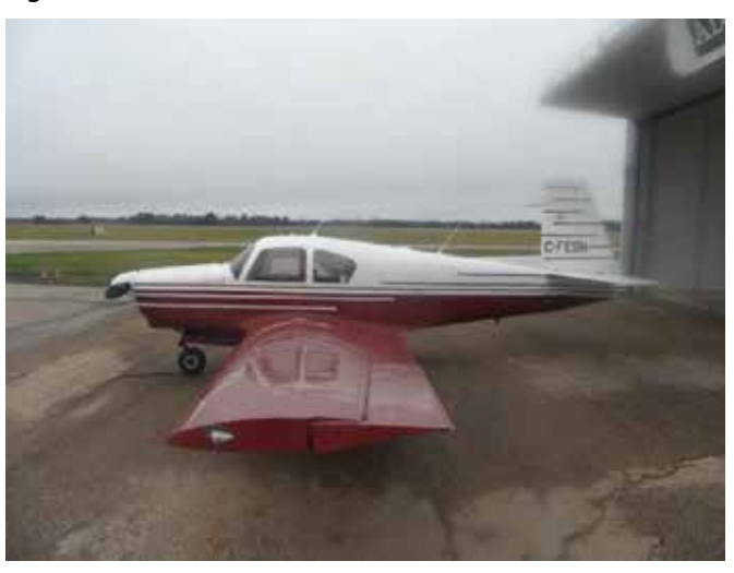
Figure 1. The occurrence aircraft

At 1422<sup>2</sup> on 25 November 2017, the privately registered Mooney M20D aircraft (registration C-FESN, serial number 192) (Figure 1) departed from Penticton Airport (CYYF), British Columbia, with 2 people on board, for a visual flight rules (VFR) flight to Edmonton/Villeneuve Airport (CZVL), Alberta. After departure from CYYF, the aircraft climbed to an altitude<sup>3</sup> of approximately 9800 feet above sea level (ASL) to cross the Columbia Mountain Range while heading directly toward Revelstoke Airport (CYRV), British Columbia. At approximately 1510, while over CYRV, the aircraft made four 360° left