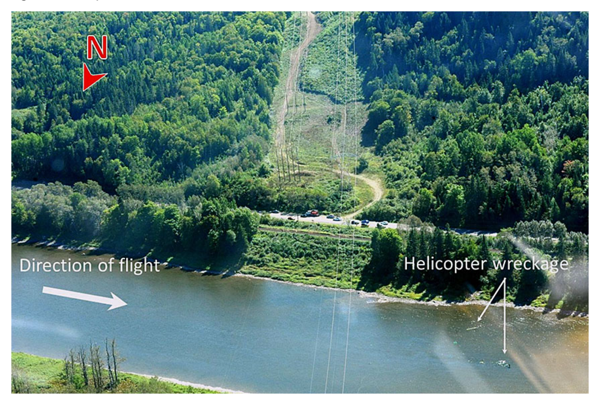
Figure 1. Aerial photo of occurrence site

At 1547, the helicopter flew into and severed 4 conductor cables of the 230 kV power transmission lines at 58 feet above the Restigouche River on the south side of Long Island (Figure 1).