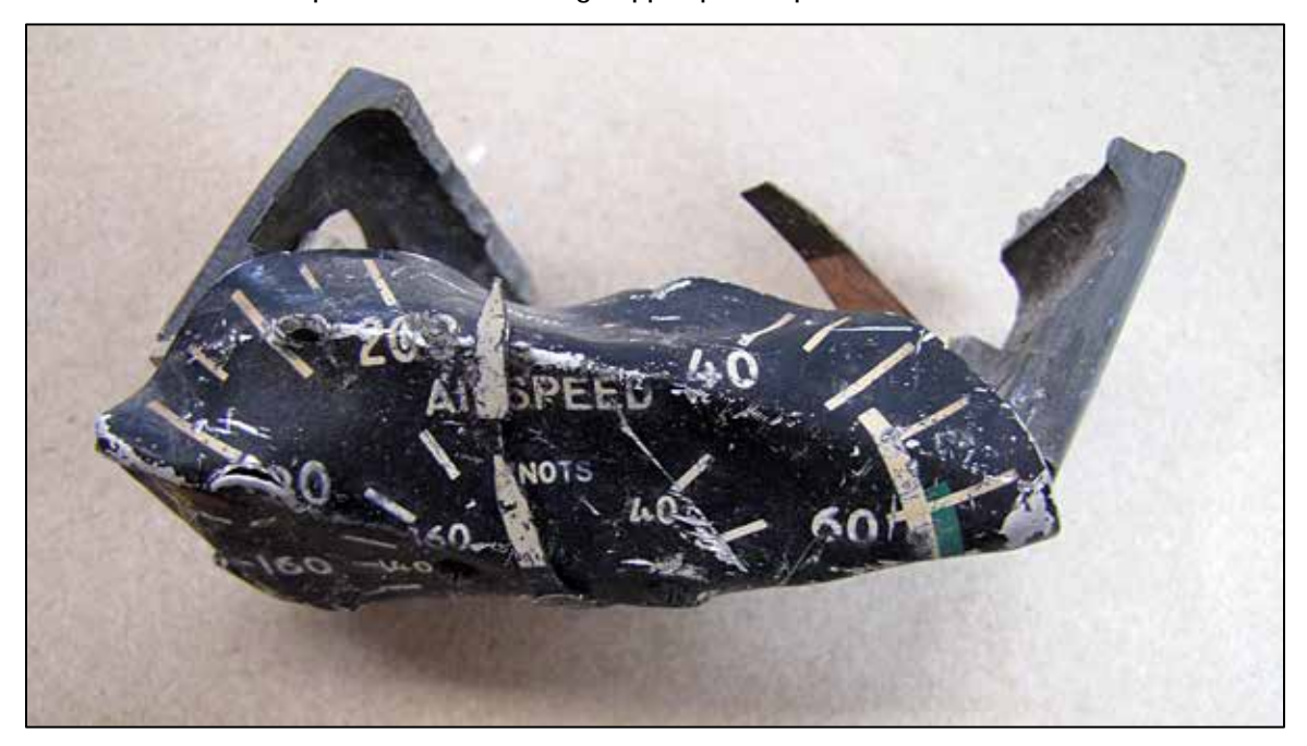
Photo 1. Occurrence airspeed indicator showing trapped pointer position

The normal operating speed range is 59 to 140 mph (manoeuvring speed). The caution range is 140 to 174 mph (the never exceed speed and red line). The highest graduation speed mark on the gauge is 210 mph. The dial face of the engine tachometer revealed witness marks indicating approximately 2550 rpm. The maximum operating speed for the engine at 5000 feet asl is 2600 rpm. The position of the throttle at the time of the accident could not be determined.