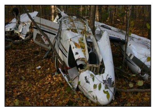
Figure 2. View of the aircraft

The right fuel tank was perforated in the impact, and the left fuel tank was completely gutted. The fuselage came to rest on its back against a tree measuring approximately 8 in. in diameter that penetrated the cabin on the passenger side (see Figure 2). A strong