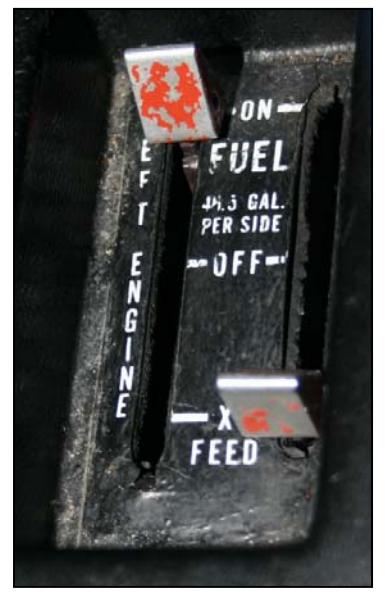
Figure 3. Fuel selector

The fuel system has two fuel selectors (see Figure 3), one for each engine, which are identified as LEFT ENGINE and RIGHT ENGINE. Each selector has three positions. The forward position (ON) enables each tank to fuel its respective engine. The central position (OFF) cuts off the fuel supply. The rear position (XFEED) is for crossfeeding, or fuelling an engine from the opposite tank. In other words, if the right fuel selector is on XFEED, the right engine will receive fuel from the left tank.