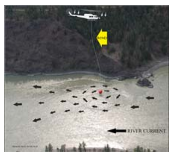
Figure 1. Water pickup before accident

At the time of the occurrence, four helicopters were engaged in forest fire water bucketing operations approximately 20 nm south of Lillooet. They were using the Fraser River to fill their water buckets. At the accident location, the Fraser River is in a canyon and was flowing south at about 9 knots. The pilots had chosen a spot in the river where there was a whirlpool. The backside of the whirlpool is characterized by back-flowing current in the opposite direction to the river current. The pilots were dipping their buckets in this back-flowing water, which prevented the current from dragging them downstream (see Figure 1).