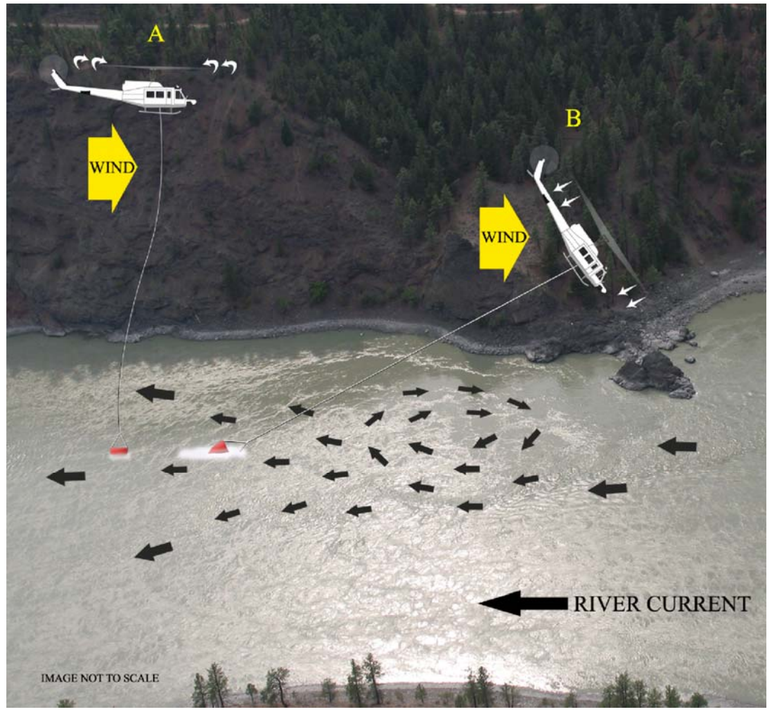
Figure 2. Accident sequence (VRS followed by bucket anchoring)

In an attempt to recover from VRS, the pilot would have pushed the cyclic forward to gain airspeed. However, the water bucket would have been full and drifting downstream, opposite to the direction of flight. This would have produced an anchor-like effect on the helicopter, causing it to pitch nose-down (see Figure 2, position B). The pilot would have quickly run out of aft cyclic travel while trying to raise the nose, causing a loss of control and the helicopter to fly in a descending arc until it collided with the water.