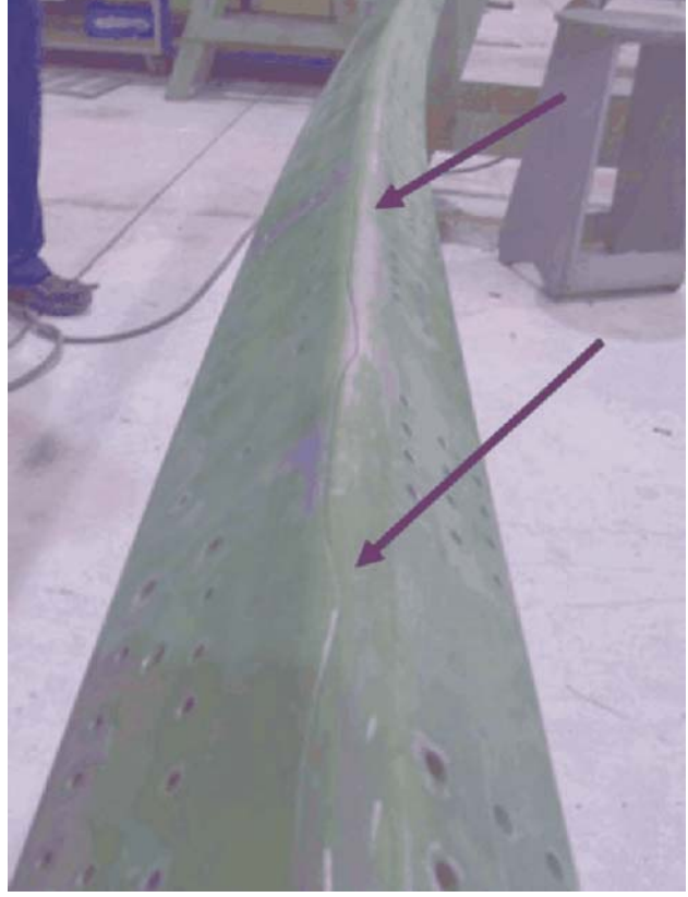
and B checks on the L-382G. Transport Canada Photo 2. Arrows indicate crack in attach angle.

issued a one-time authorization to First Air to