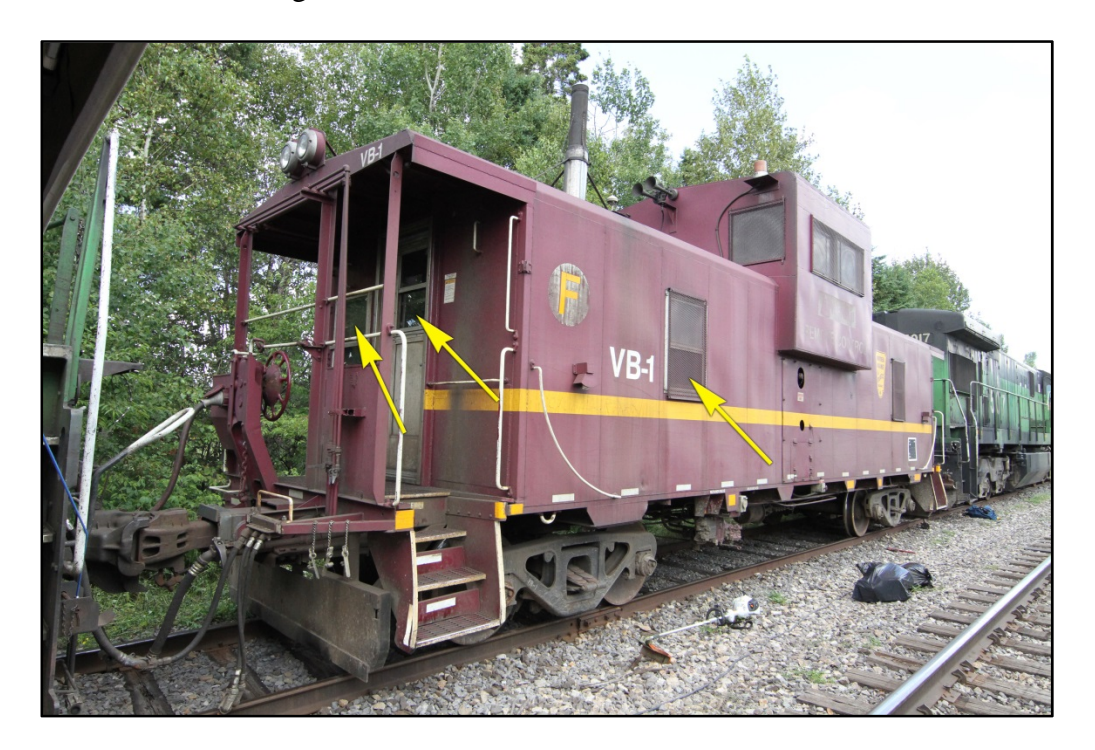
Figure 6: The 3 areas of illumination observed in the security camera video.