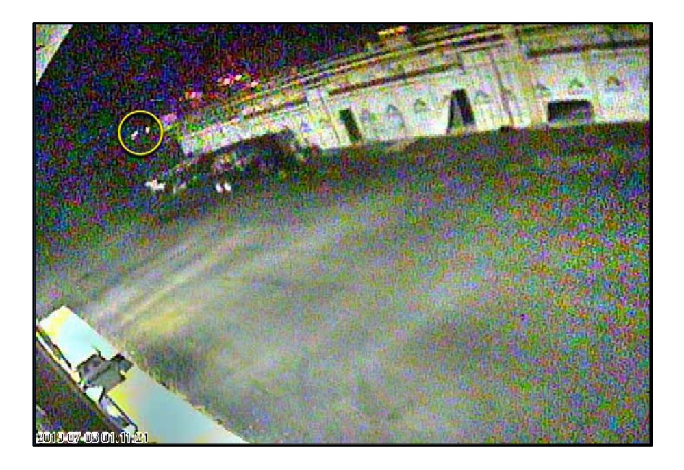
Figure 4: Unknown light source passing from left to right with train MMA 002 at 1:11:21 am (yellow circle).