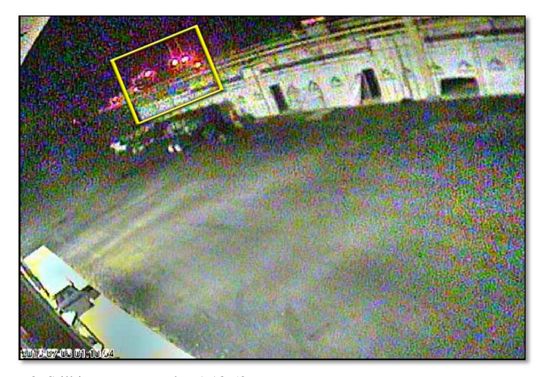
Figure 2: Still image captured at 1:10:52 am. Shows activation of the crossing lights (yellow box) before freight train MMA 002 passes by.