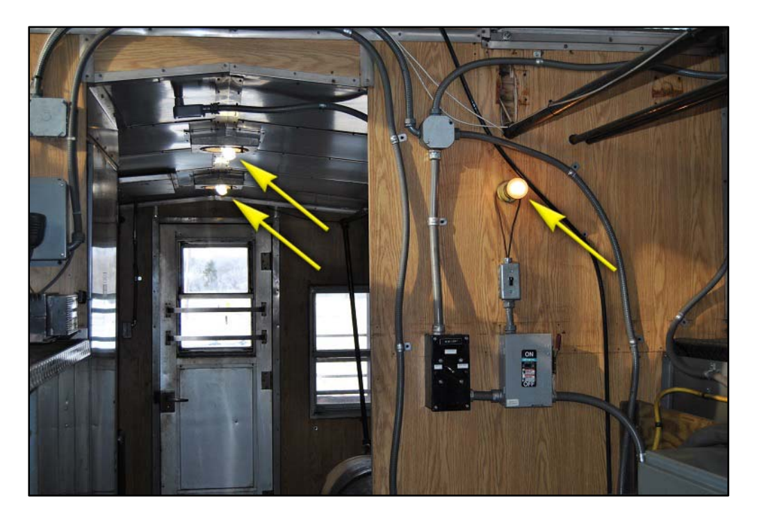
Figure 7: Inside view of the rear of the VB car showing position of light bulbs and rear windows.