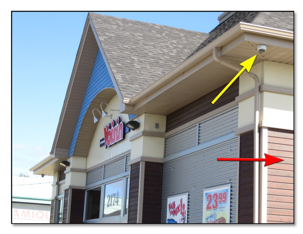
Figure 1: Security camera on the Dépanneur Voisin/Ultramar gas station (yellow arrow). Red arrow points to the direction of the railway crossing over Highway 161.