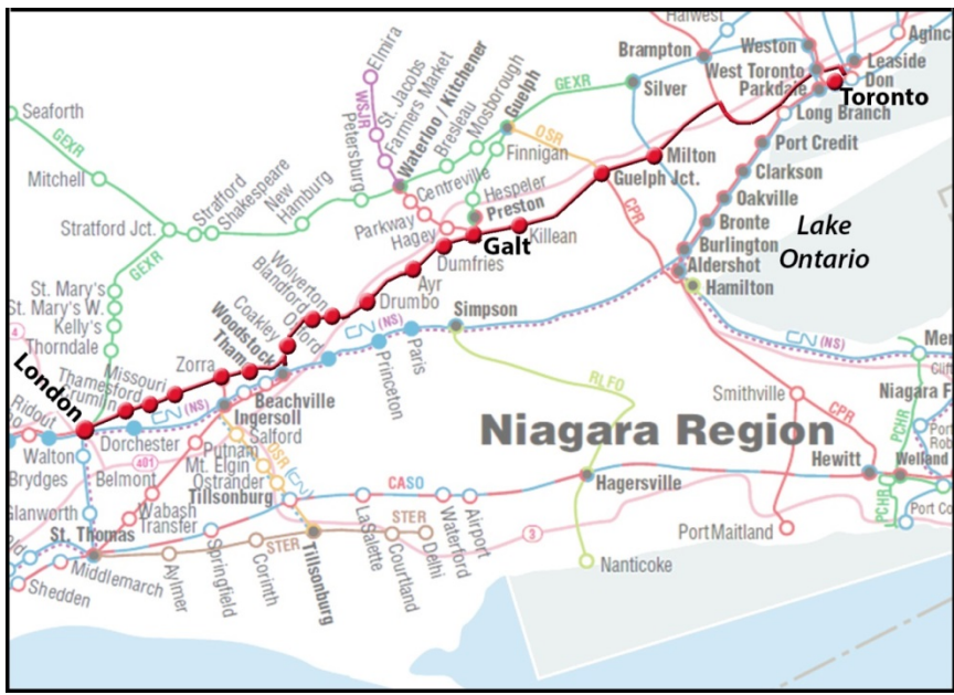
Figure 1. Intended route of CP freight train 147-01 (Toronto, Ontario, to London, Ontario)

On 01 December 2012, Canadian Pacific Railway (CP) freight train 147-01 (the train) was proceeding westward on the Galt Subdivision, en route from Toronto, Ontario, to London, Ontario (Figure 1). The train consisted of 2 head-end locomotives and 68 loaded intermodal flat cars. The train weighed 4894 tons and was 6573 feet long. The crew comprised a locomotive engineer and a conductor, who were both qualified for their respective positions and met established rest and fitness requirements.