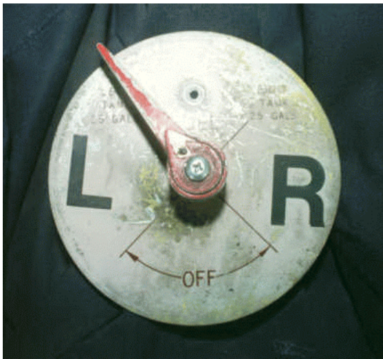
Figure 1 – Fuel selector in left detent

The fuel tank selector has left and right ON positions at 45° up from the horizontal and two OFF positions at 45° down from the horizontal (Figure 1). Two large letters, L and R, had been glued to the selector dial face between the OFF and ON detents on each side. The date at which these letters were installed was not determined. The fuel selector allows fuel to be drawn from either the left or right fuel cell and provides a means to shut the fuel off. Detents in the fuel selector